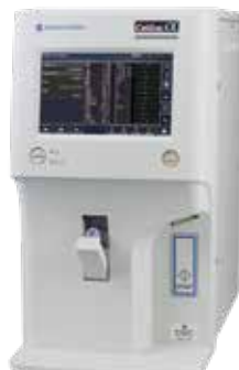
MEK-1302 (open and closed mode)