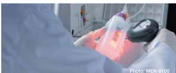
Standard accessory, barcode reader