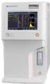
MEK-1301 (open mode only)

Celltac α has 2 different models; MEK-1301 and MEK-1302. MEK-1301 has open measurement mode and MEK-1302 has both open and closed measurement modes.